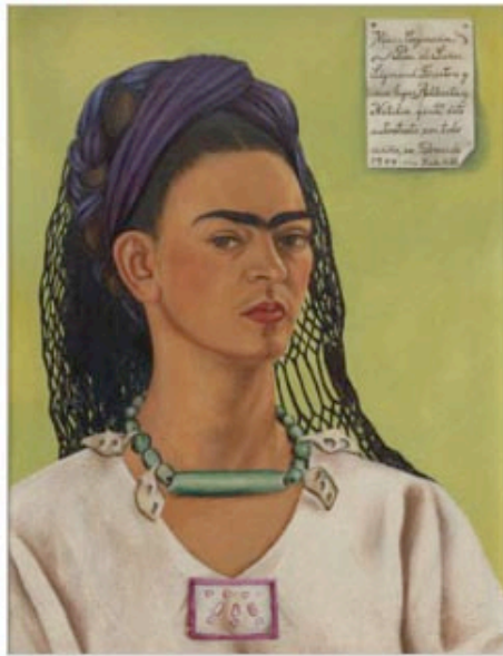
Frida Kahlo, Autorretrato, painted in 1940.

LONDON.- Artists and Lovers traces a number of the greatest artistic partnerships of the mid-20th century to suggest how love and friendship can shape creative process. The show will be exhibited in Savile Row, London, from 16 September until 29 October 2016, and then travel to Orodvas' outpost gallery space on New York's Upper East Side from early November 2016, until end of January 2017. Presenting a striking selection of sculpture, painting, photography, dance, music and film, the exhibition aims to bring fresh perspective to intriguing and significant artistic alliances, from well-known couples such as Frida Kahlo and Diego Rivera, to more private artistic pairings, including the long friendship between Joseph Cornell and Yayoi Kusama. Artists and Lovers will feature a major Frida Kahlo self-portrait, painted in 1940, and Silver Square, painted by Jackson Pollock circa 1950, a work that was hung for many years in the New York ... More