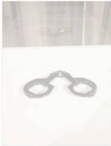
A view of "Handcuffs" by Ai Weiwei at the UNITAS 2nd annual gala against human trafficking at Capitale on September 13, 2016 in New York City.

AMSTERDAM (AFP).- Chinese dissident artist Ai Weiwei Thursday unveiled thousands of mobile phone pictures of refugees at his newest exhibition, saying it aimed to speak with "one voice" for those who have fled to Europe's shores. Entitled #SafePassage, the exhibition in Amsterdam's Foam museum of photography features images snapped by Ai since December, during visits to refugee camps in France, Greece, Israel, Syria and Turkey. It also includes sculptured marble lifebuoys and a marble surveillance camera, which Ai said represent the "struggle between the individual and the structures put in place to dominate society". "I want to show my position" on the refugee crisis, Ai told journalists and art experts gathered for the exhibition's launch at Foam, situated in the heart of the historic ... More