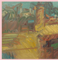
GO: The London Painters @ Ordo vas - WIS 2ER - Through Saturday, 28 April

Bacon's lover George Dyer plays centre stage in this major group show, with a tender portrait by Lucian Freud of him next to a Bacon's more disturbing portrayal.