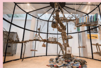
GO: Mark Dion: Theatre of the Natural World @ Whitechapel Gallery - E1 7QX - Through Sunday, 13 March

Activist and Artist who has travelled through rainforests and rubbish dumps in order to create works which reveal the wonder and fragility of our world.