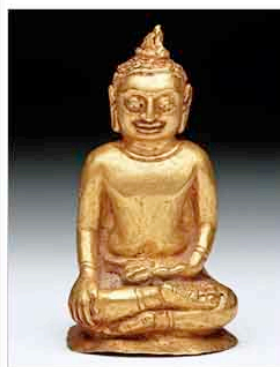
Burmese high-karat gold Buddha figurine, circa 12th century CE, estimate $20,000-$30,000.

Where ancient art meets modern eyes: Artemis Gallery at the forefront of the live auction arena