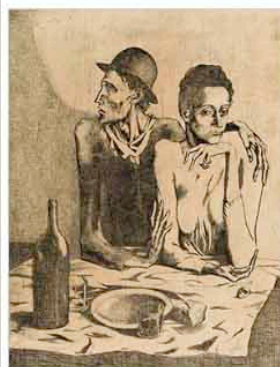
Pablo Picasso Spain (1881-1973) / Le Repas frugal (The frugal meal) (from 'La Suite des Saltimbanques' series) (detail) 1904, printed 1913 / Etching and scraper on Van Gelder Zonen wove paper / Purchased 2015 with funds from the Margaret Olley Art Trust through the Queensland Art Gallery | Gallery of Modern Art Foundation

Queensland Art Gallery in Brisbane acquires five rare prints by Pablo Picasso