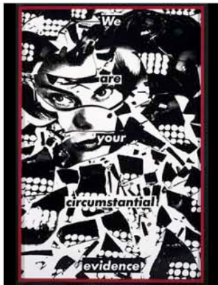
Barbara Kruger, Untitled (We are your circumstantial evidence) , 1981 (detail), black and white photograph, 91 1.2 x 61 1.2 in. © Barbara Kruger, Courtesy of the artist and Skarstedt.

Exhibition of seminal early works by American artist Barbara Kruger opens at Skarstedt London