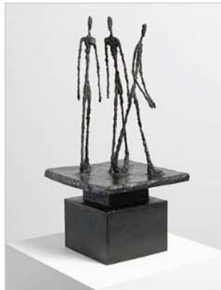
Alberto Giacometti, Trois hommes qui marchent, 1948.

Alberto Giacometti and David Smith, side by side, in new exhibition at Ordovas