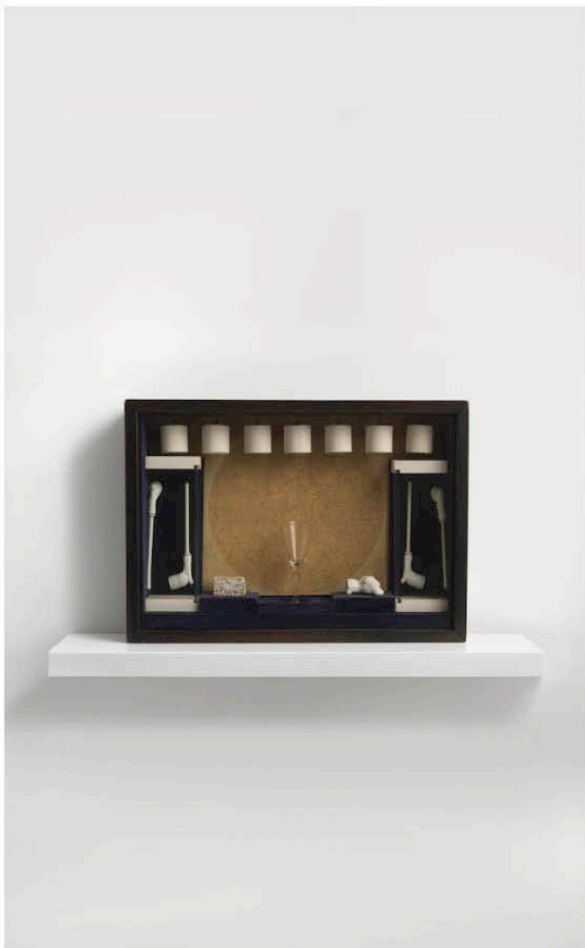
Joseph Cornell Soap Bubble Set (1948).

Related: Yayoi Kusama's 'Infinity Mirrors' Will Tour US, Guaranteeing a Blockbuster