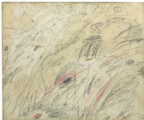
Cy Twombly, Untitled (1961).

Related: See Classic Album Covers by Artists from Nobuyoshi Araki to Andy Warhol