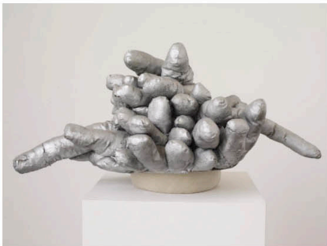
Yayoi Kusama Hat (1962).

Yayoi Kusama met Joseph Cornell, who was 26 years her senior, in New York as she was beginning to find success as an artist. Kusama described their relationship as passionate and platonic and when Cornell passed away in 1972, Kusama created a series of works in tribute to him, including Hat (1962), which are on view with Cornell's Soap Bubble Set (1948).