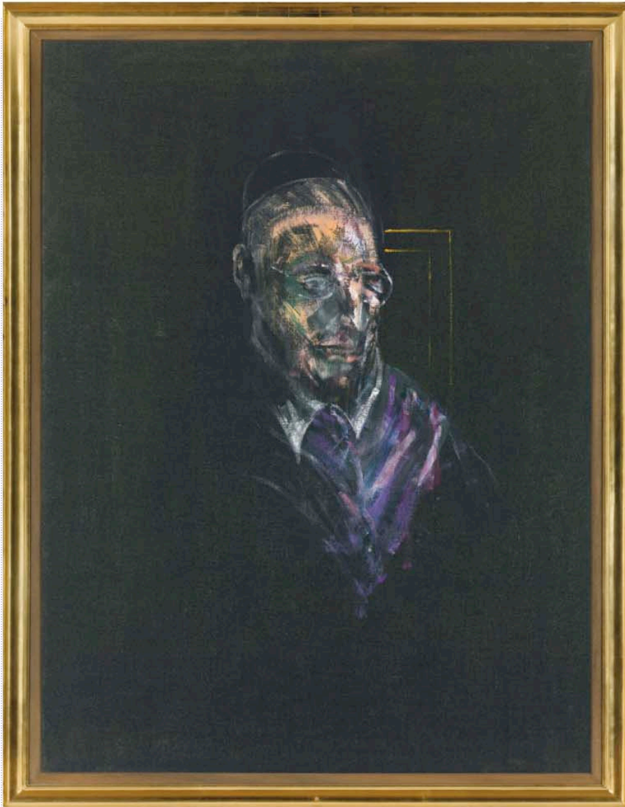
"Study for a Head" by Francis Bacon is a portrait of Pope Pius XII from 1955 and is valued at 9 million pounds at Christie's in London.