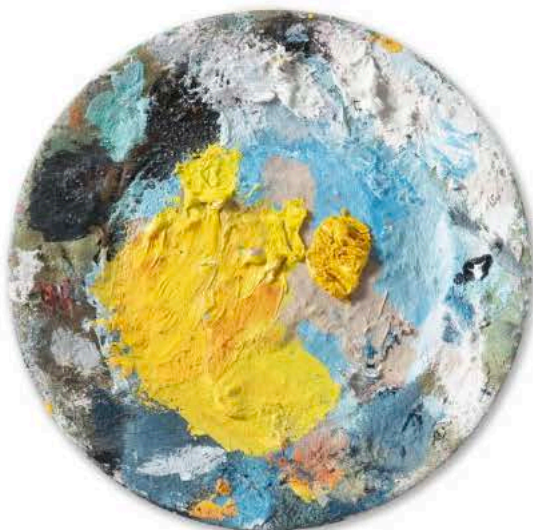
Photograph: Francis Bacon

Francis Bacon, known for his brutally visceral paintings of screaming popes and writhing figures, also worked in London as an interior designer. Rare surviving objects from the time - including his rugs, lesser-spotted paintings and this plate/palette - are now up for auction. Read the full article.