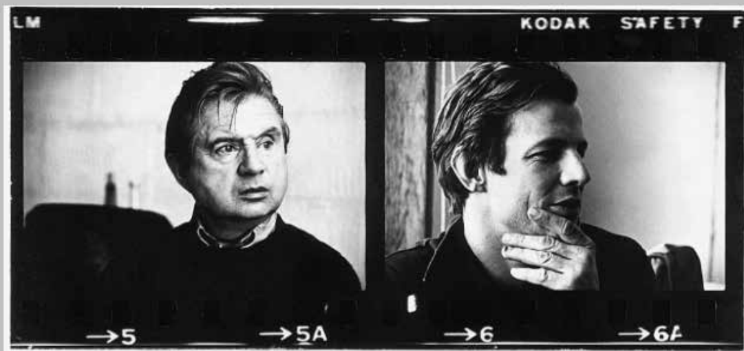
Francis Bacon and Peter Beard photographed during 'The Dead Elephant Interviews'. 1972

Wild Life: Francis Bacon and Peter Beard on view at Ordovas Gallery