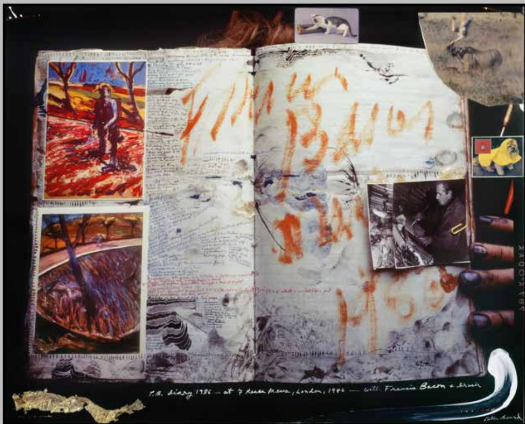
Peter Beard, P.B Diary 1986 at 7 Reece Mews, London, 1986 – with Francis Bacon + brush, 1986/1993

RD: Can you explain the similarities between the two artists?