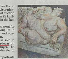
Freud's Benefits Supervisor Resting