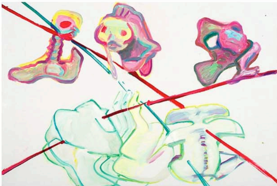
'Schicksalslinien/Be-Ziehungen VIII' ('Lines of Fate'/'Re-lations VIII'), 1994, by Maria Lassnig

How do you make a work of art? One method is to cut things up and stick them back together in a different order. That is, roughly speaking, the recipe for collage. Thus in 1934 Max Ernst snipped away at a pile of illustrations to 19th-century novels, reassembled them in an altered fashion, and came up with Une semaine de bonté — or A Week of Kindness — a surrealist novel in pictures.