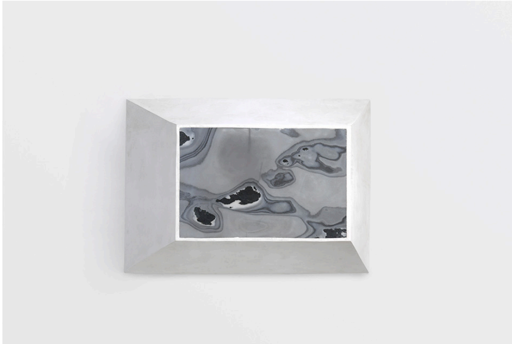
Blood. Executed in 2013.