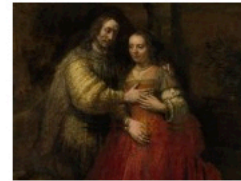
Rembrandt (1606-1669), Isaac and Rebecca, Known as 'The Jewish Bride' , ca. 1665-69 Rijksmuseum Amsterdam

Rembrandt - Auerbach: Raw Truth exhibition is organised in collaboration with Ordovas, London.