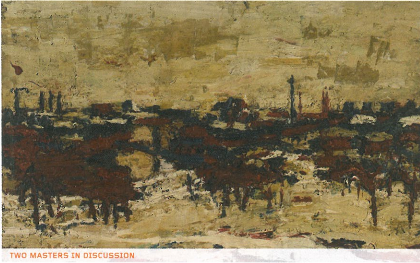
TWO MASTERS IN DISCUSSION